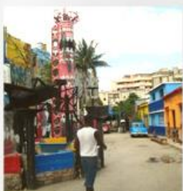
Callejon de Hammel Havana

On the way back to Havana we stop in at the town of Santa Clara, a key city in the Cuban Revolution . Upon entering Santa Clara, there is a huge statue of Ernesto Ché Guevara , to commemorate his death and that of the revolutionaries who died along with him in Bolivia. There is also a museum here dedicated to his amazing life