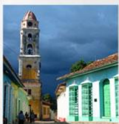
Trinidad's historical centre

For most visitors to Cuba, Trinidad is their standout favourite destination (well, for the ones that make it this far anyway). No other colonial city in Cuba is so well preserved, and the local residents are extremely friendly and festive . Trinidad is steeped in religiosity, none the least of which is Santería , which is one of several Afro-Cuban religions . The thing however that visitors most love about Trinidad is the nightlife . There are no less than 10 live music venues all within a short walking distance. Many of these have lovely outdoor settings, in courtyards, and within the walls of old colonial ruins. We are near the lovely Valle de los Ingenios (Valley of Sugarmills) and Playa Ancón - where you can enjoy long stretches of unspoiled, white sand beaches . Scuba diving, snorkeling, swimming in waterfalls and horse-riding are other optional activities.